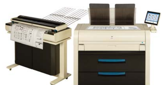
KIP 7590 Production MFP

(Note: KIP Scan Systems cannot be placed on top of the 75 Series)