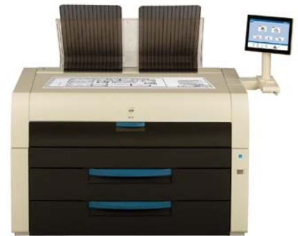
KIP 7970 Print Systems