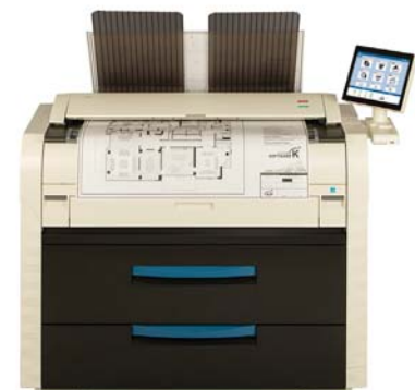
KIP 7580 MFP