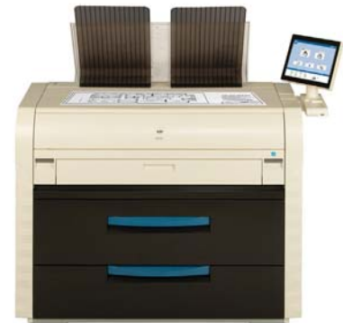
KIP 7570 Print Systems

(Note: KIP Scan Systems cannot be placed on top of the 75 Series)