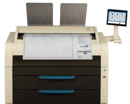
KIP 7980 MFP