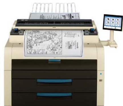
KIP 7990 Production MFP