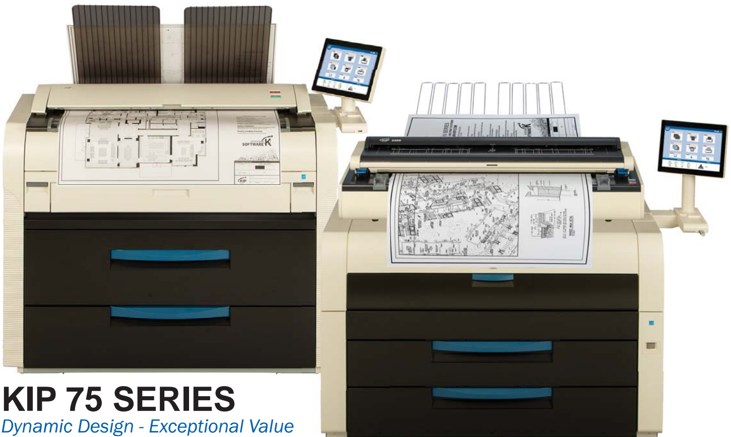
KIP 75 SERIES Dynamic Design - Exceptional Value

New KIP 75/79 Series System Configurations and Specifications